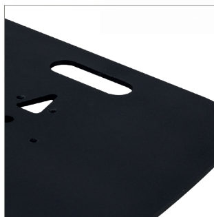
Grab handles allow for easy handling