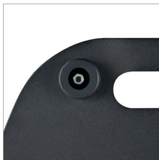
Non-marking rubber feet for increased stability