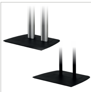
Designed for use with a single or double B-Tech Ø50mm floor stand poles or BT8381 vertical support columns

Max load when used with twin columns or poles