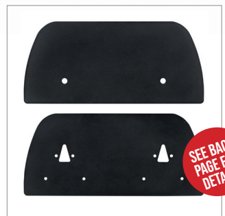
A choice of cover plates hide grab handles and unused fixing points for a smart finish (sold separately)